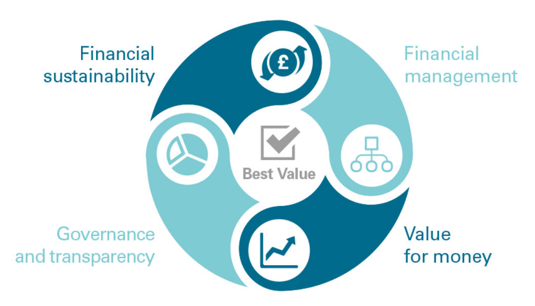
Exhibit 1 Audit dimensions